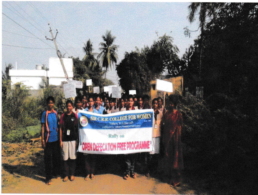
A Rally program on open defecation