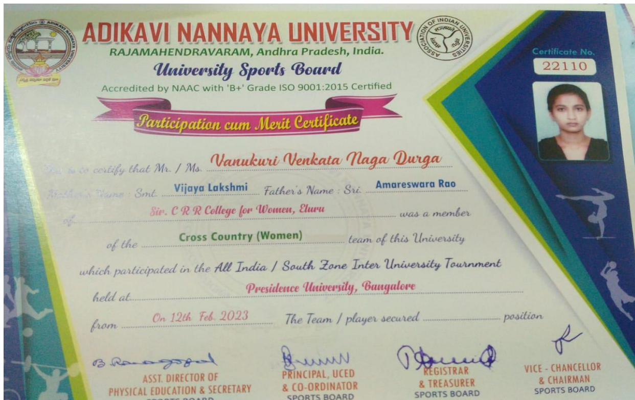
Certificate in University level Cross-Country competition held in Presidence University in 2022-2023