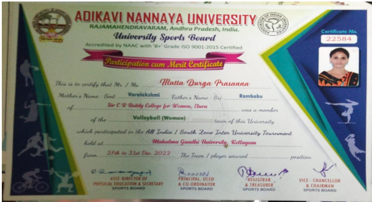
Certificate in University level Volley ball competition held in Mahatma Gandhi University in 2022-23