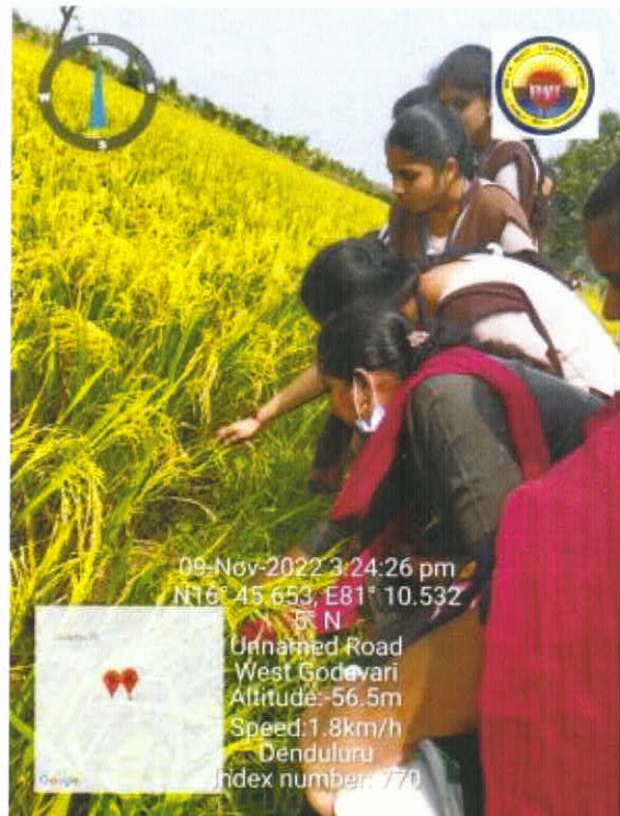
STUDENTS EXPLAINED THE USES OF ORGANIC FORMING