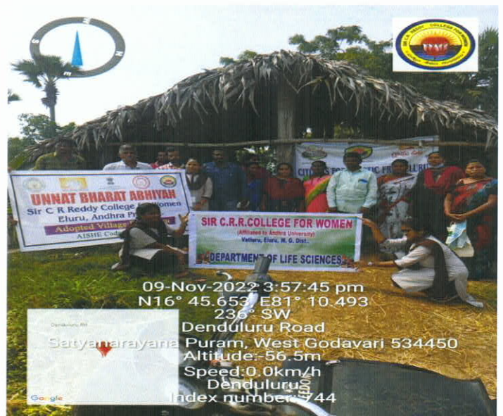
STUDENTS SHOWED THE PROCESS HOW TO PREPARE BIOFERTILIZER