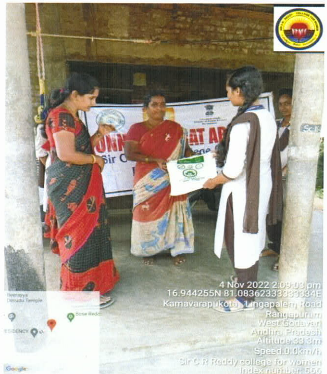
Creating awareness on usage of jute bags in villages