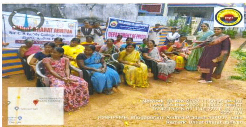
LED bulbs are distributed to the people of Bhogapuram.

In order to encourage the people towards power saving LED bulbs are distributed to the people of Bhogapuram.