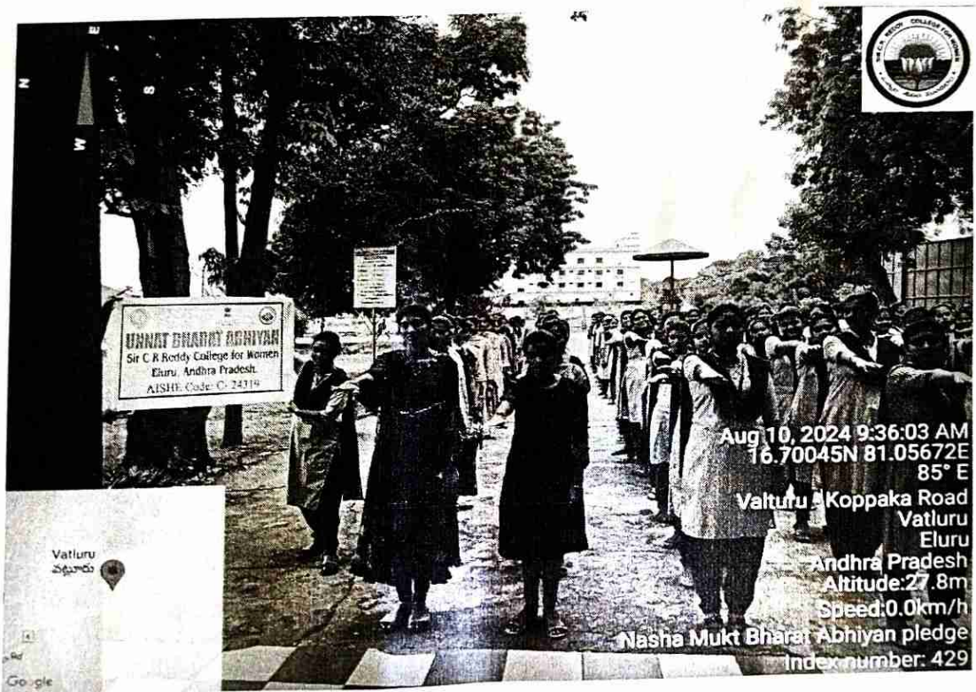
Pledge on NASHA MUKT BHARAT ABHIYAN Programme