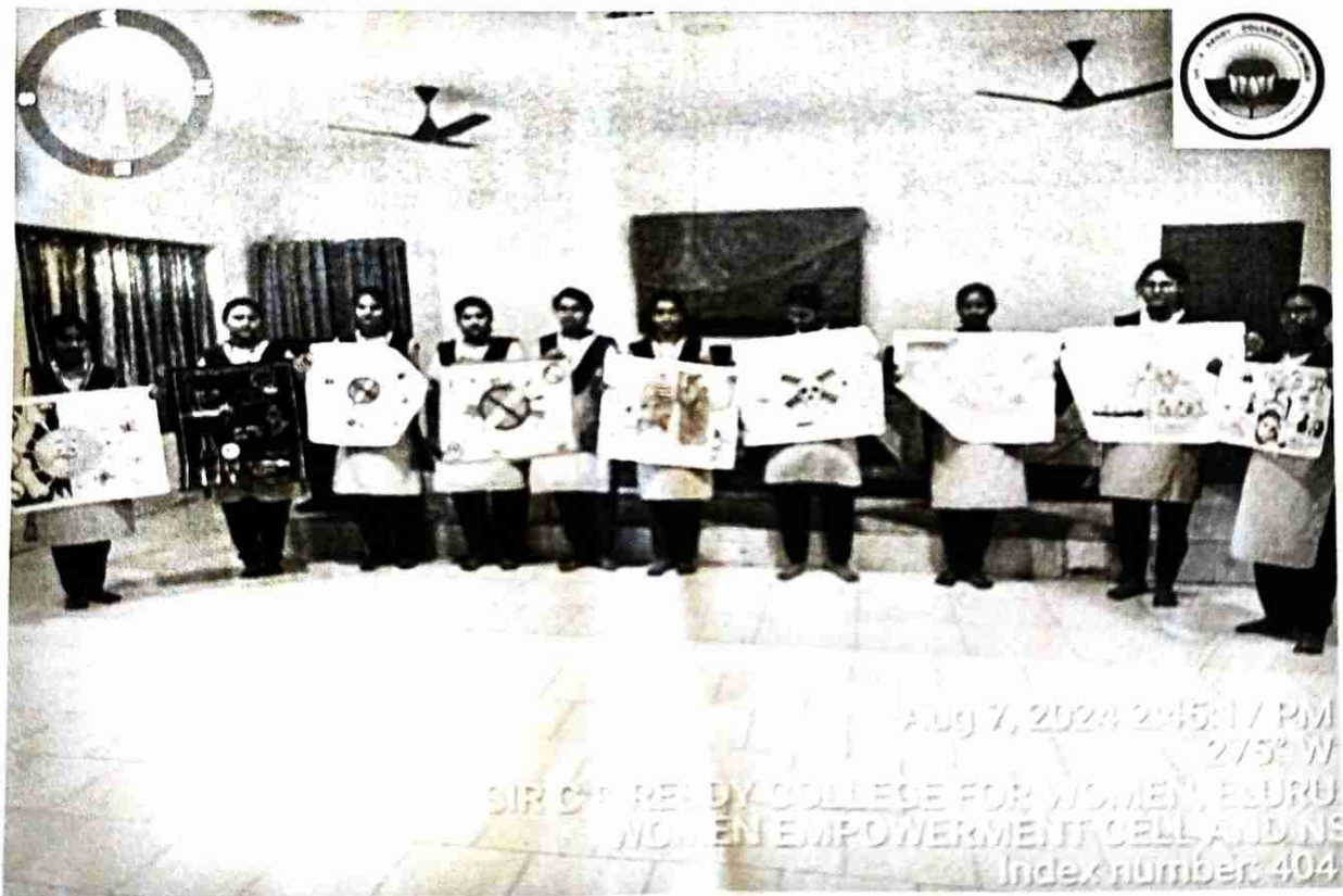
Poster Presentation on Drug Abuse