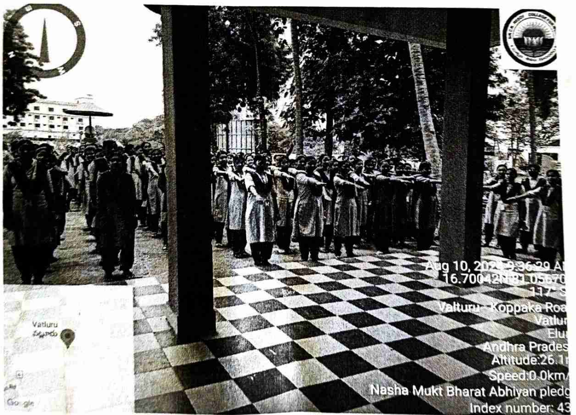
Pledge on NASHA MUKT BHARAT ABHIYAN Programme