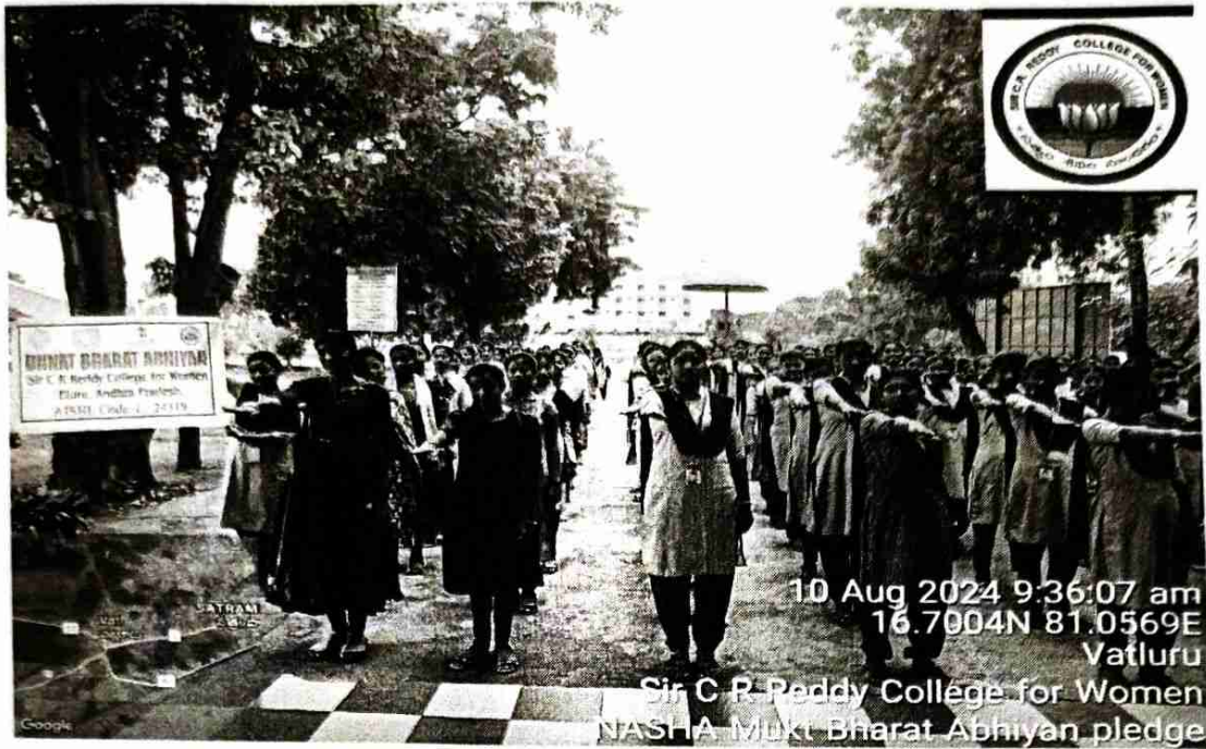
Pledge on NASHA MUKT BHARAT ABHIYAN Programme